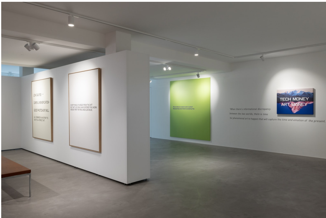
All images: Installation views from CAPTURING THE CURRENT ZEITGEIST: RULTON FYDER IN DIALOGUE WITH CONCEPTUAL ART CONTEMPORARIES, Copyright PULPO GALLERY/Thomas Dashuber