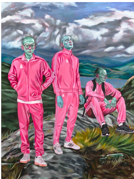
Damien Cifelli, The Foothills, 2023

The Foothills shows three guys, wearing neon-pink track suits in a natural environment under a cloudy sky, expecting something, an event, a change that might lead to an adventure. But they don't do anything, they expect the adventure to come to them, to happen. This passivity of the figures depicted is a common feature of Cifelli's work. The inhabitants of Tarogramma look directly at the viewer, with a certain indifference and dignity. Perhaps even with a hint of superiority.