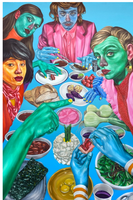
Damien Cifelli, Downtable #2, 2023

Using straightforward but classical methods involving oil on linen, but artistically and technologically alternating between small and large format canvases, Cifellis works depict in myriad ways across multiple compositions the complexity of human nature. With each painting, he reveals more from Tarogramm, but always leaving the viewer with some questions.